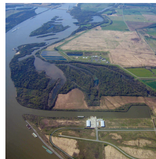
Slackwater harbor with 170 ft. dock.

The Port of Little Rock is part of the 448-mile McClellan-Kerr Arkansas River Navigation System completed in 1971, which runs from the Mississippi River northwest to 15 miles east of Tulsa, OK.